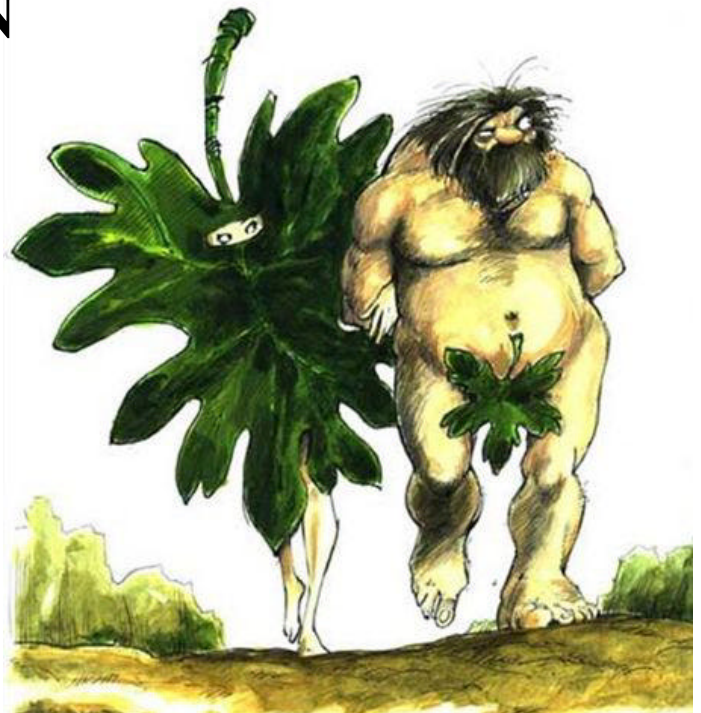
MUSLIM ADAM AND EVE