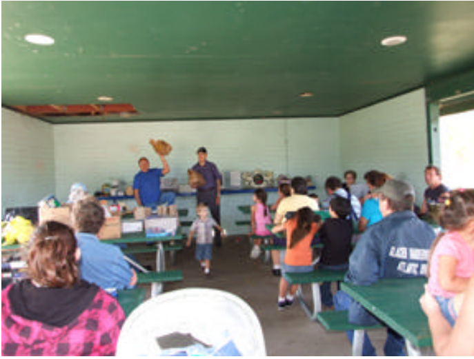
Our "Action Auctions" are always a fun event. This year was no exception. Even with a smaller crowd, we all enjoyed the food and auction activities and many went home with some real bargains!